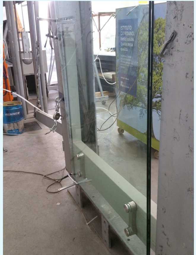
Photographs of the sample