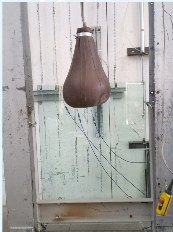
Photograph of the sample after impact in the centre of infill