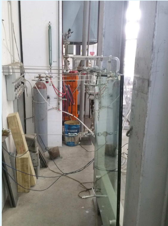
Photograph of the sample during outward horizontal static loading test