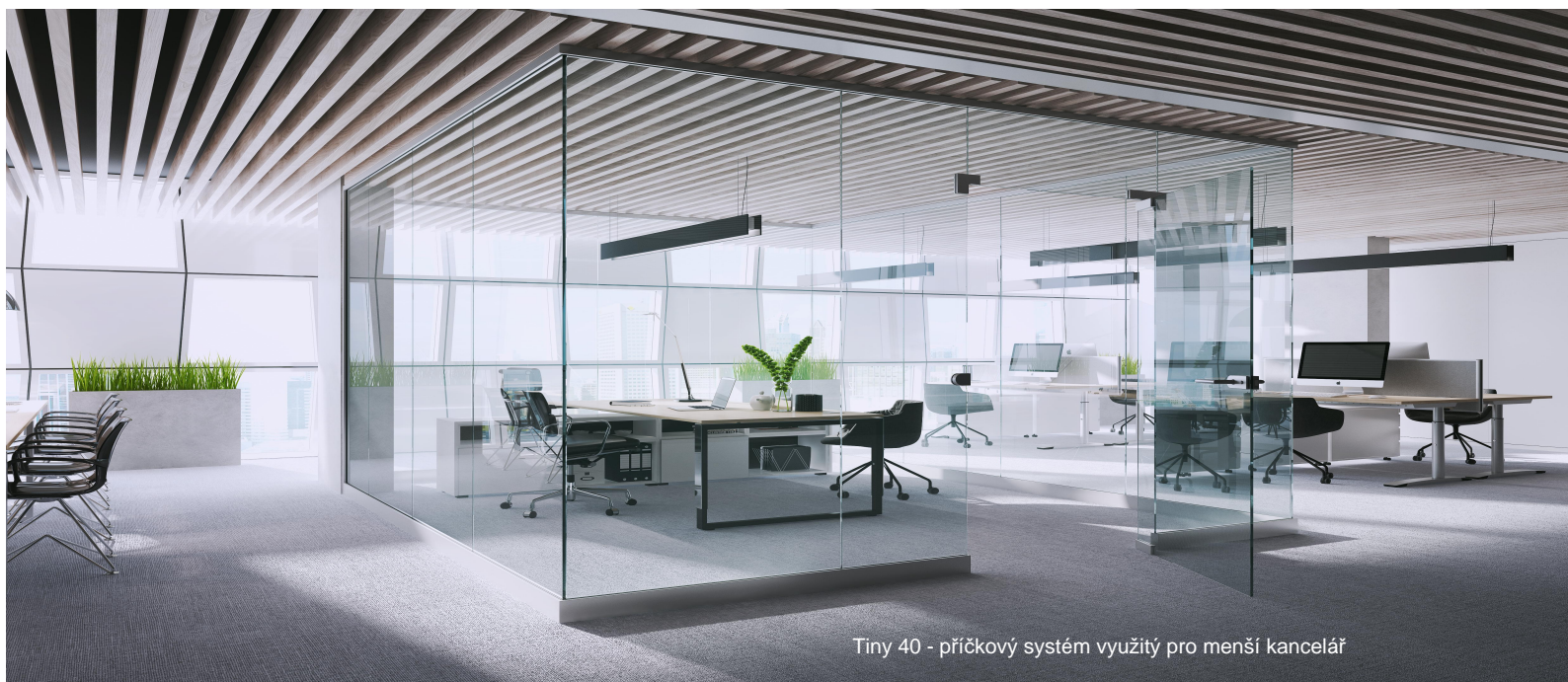
Tiny 40 - příčkový systém využitý pro menší kancelář

Společnost vedená u Krajského soudu Brno IČO: 10838082 DIČ: CZ10838082